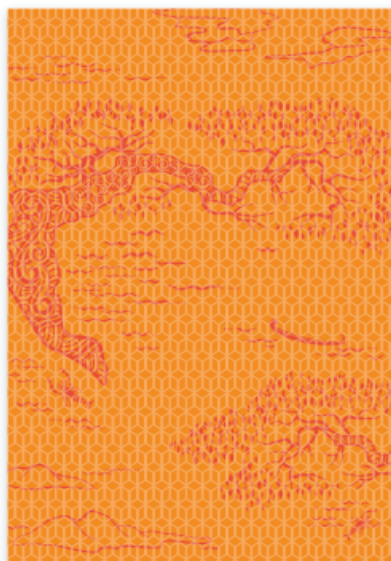
Raffles Jakarta, Indonesia Secondary Device

Shown here is the Secondary Device specifically created for, and solely to be used by Raffles Jakarta, Indonesia.