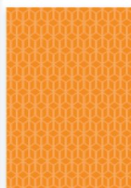
Geometric pattern detail