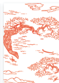
Organic pattern detail